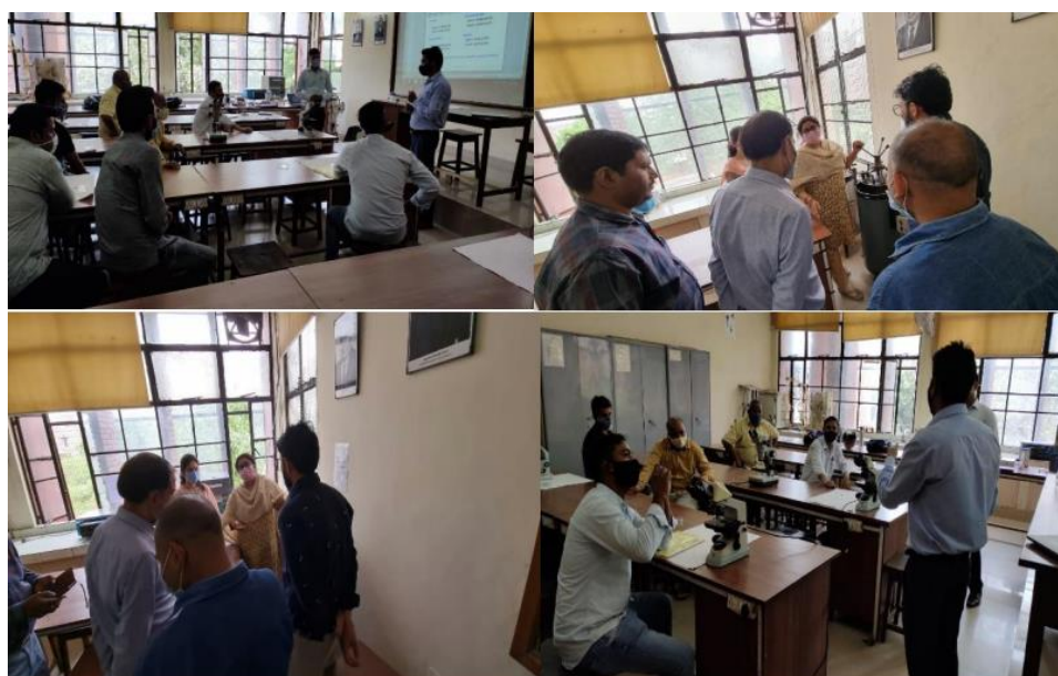
Intra-College Lab Skill Training Programme on 21-4-22 in Botany Department